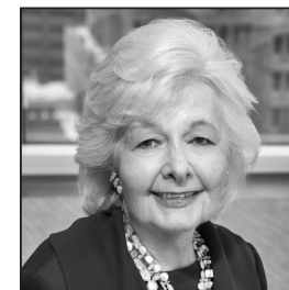
THE HONORABLE MARGARET H. MARSHALL Doctor of Laws, Honoris Causa

Chief Justice of the Massachusetts Supreme Judicial Court ( Ret. ) B.A. University of the Witwatersrand, Johannesburg M.A. Harvard University J.D. Yale Law School